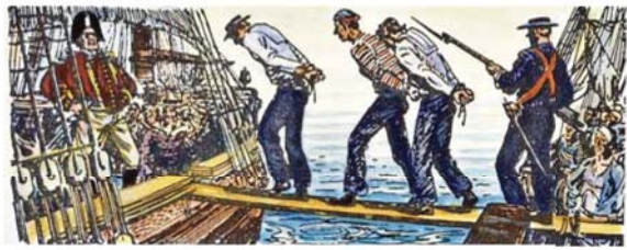
Visual Vocabulary impressment

coercion (ko•ER•shun) practice of forcing someone to act in a certain way by use of pressure or threats