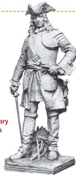
Visual Vocabulary statue of James Oglethorpe