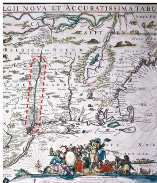
Visual Vocabulary antique map showing New Netherland

patroon person rewarded with a large land grant for bringing 50 settlers to New Netherland