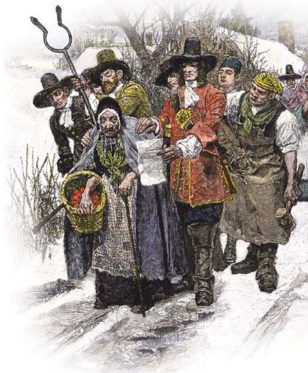
An elderly woman being arrested for witchcraft in Salem

Why do you think the girls accused so many people of witchcraft?