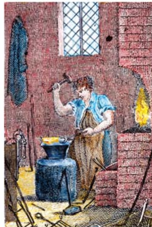
Visual Vocabulary blacksmith

tolerance acceptance of different opinions