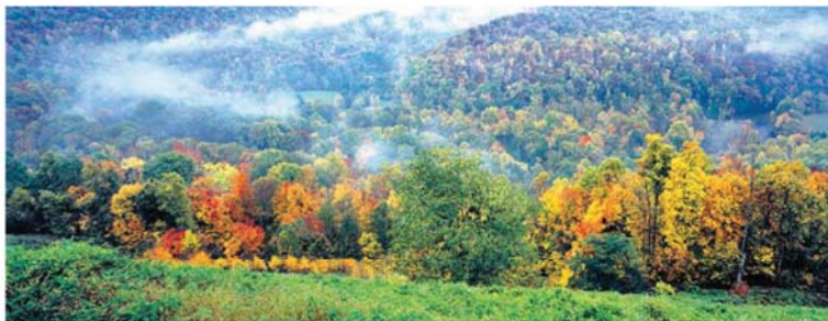
Visual Vocabulary Appalachian Mountains

clans large groups of families that claim a common ancestor